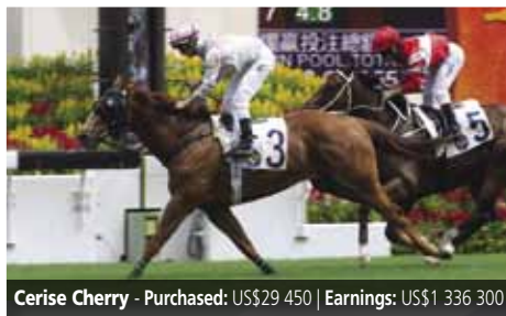
Cerise Cherry - Purchased: US$29 450 | Earnings: US$1 336 300