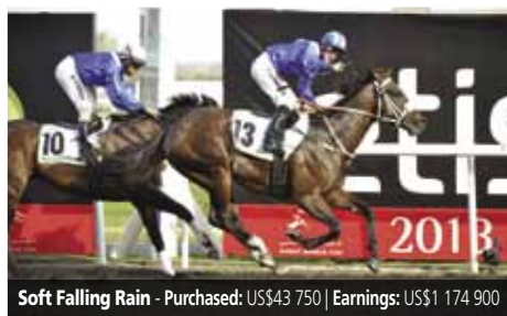
Soft Falling Rain - Purchased: US$43 750 | Earnings: US$1 174 900