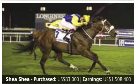
Shea Shea - Purchased: US$83 000 | Earnings: US$1 508 400