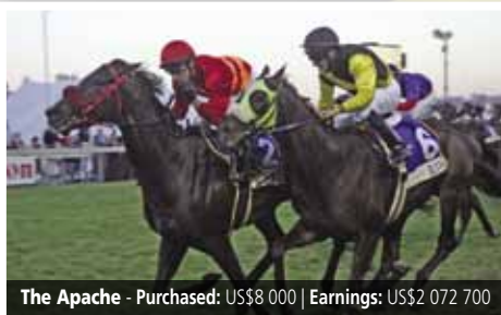
The Apache - Purchased: US$8 000 | Earnings: US$2 072 700

Scott Brothers-bred champion The Apache, a dual Gr.1 winner at three, showed his class when making a triumphant Dubai debut in the Gr.2 Al Rashidiya, almost a year to the day of his final South African racetrack appearance.